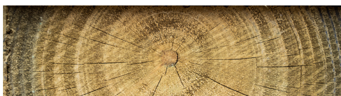
Classic close-up colour